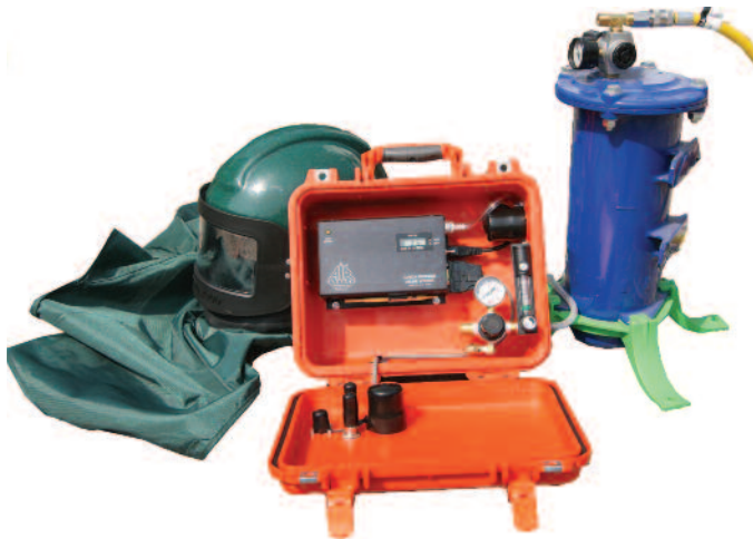
CO91-14LAC Portable CO Monitor