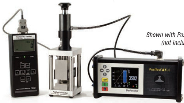
Shown with PosiTest AT-A (not included)

Note: Device displays Imperial units only.