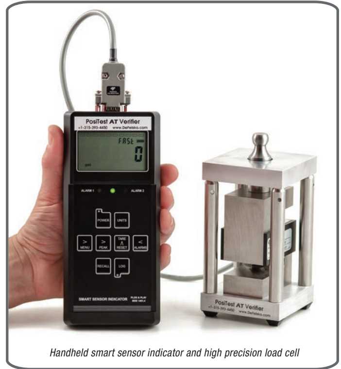
Handheld smart sensor indicator and high precision load cell